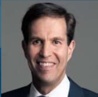
Ken Mehlman KKR