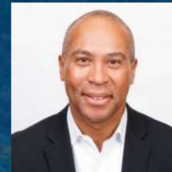
Deval Patrick Bain Capital