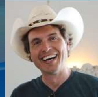
Kimbal Musk The Kitchen